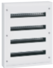
3 372 04

“ready to use” metal distribution cabinets