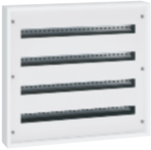
3 372 14

“ready to use” metal distribution cabinets