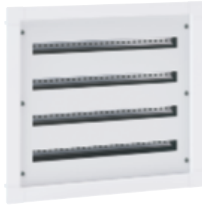
3 372 34