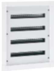
3 372 24